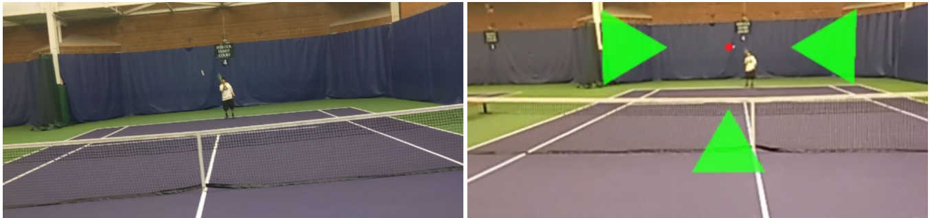
Figure 1: Comparison of first-person POV footage captured directly from the HoloLens with (right) and without (left) ARTennis