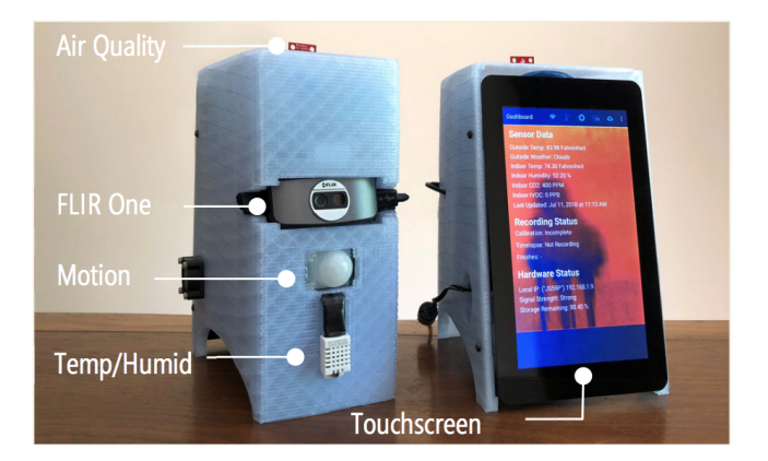
Figure 1: Our temporal thermographic sensor system, Thermporal , is designed to collect and store all the data necessary for performing quantitative analysis of insulation performance and includes: a FLIR One thermal camera, environmental sensors, and a Wi-Fi connection for accessing weather data; users primarily interact with the system using a touchscreen display.

To address these challenges, we present an easy-to-deploy, temporal thermographic sensor system (Figure 1) designed to support residential energy audits through a quantitative analysis of imagery from multiple time-series captures of a building's envelope. Our custom-built system, called Thermporal, combines low-cost, off-the-shelf hardware with a novel software suite to semi-automatically collect, analyze, and report on temporal thermographic data from nightly scans. Prior work in temporal thermography has focused on algorithmic performance and evaluations in controlled, unoccupied spaces (e.g., [10,18]). In contrast, our primary research questions are human-centered: What might users learn from temporal thermographic assessments of building envelope performance? How does using our temporal thermography system influence user behaviors or perspectives? What do professional auditors think of temporal thermography systems and how do their views differ from homeowners? And, finally, what design implications are there for future thermographic systems?