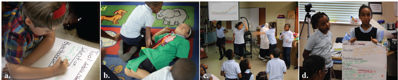
Figure 1. In this paper, we present a four-day deployment study of LPSV tools in a formal classroom environment where (a) children brainstorm questions, test hypotheses with a model-based tool called (b) BodyVis and with an analytic-based tool called (c) SharedPhys , and (d) present their experiment results.