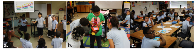
Figure 5. Different physical setups of classrooms affect learners' collaborative inquiry. (a) First grade and (b) second grade have more open space, while (c) fourth grade space is limited.

learners moved about in the space, further limiting learners' abilities to interact with BodyVis and SharedPhys.