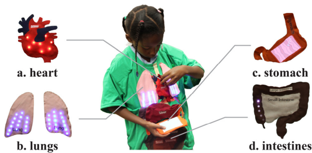
Figure 2. BodyVis shows internal layers of the human body along with physiological phenomena of the wearer. Shown above: (a) the heart vibrates and lights up according to the wearer's heart rate, (b) the lungs visualize the breathing rate with lights, (c) the stomach shows how food is processed, (d) the intestines illuminate the digestion pathway.

physical movement, live physiological data, and social/temporal comparisons. Both BodyVis and SharedPhys use a wearable chest strap sensor (the Zephyr BioHarness 3 [60]) that measures heart rate, breathing rate, and movement and wirelessly communicates this data in real-time.